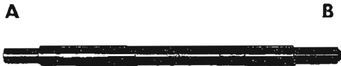
Figure 2. Alignment Shaft (C-91-48247)